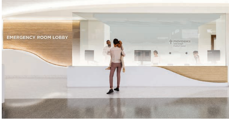
Built in 1980, our current facility is over 40 years old. The expansion your donation makes possible is vital in helping us plan for the future.

Due to the growing needs of our community, we are one of the busiest Emergency Services Departments in Los Angeles County.